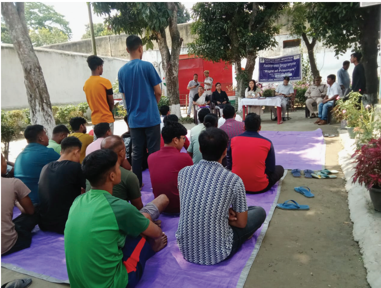
DLSA, Majuli (Assam) at District Jail, Majuli

March 26, 2025: DLSA, Majuli (Assam) organized an awareness programme at the District Jail, Majuli, focusing on key aspects of the Premature Release, Parole, and Furlough of Prisoners, along with the broader Rights of Prisoners. The programme was focused on generating consciousness amongst the inmates and prison authorities about legal safeguards and mechanisms available under the law to ensure humane and just treatment of incarcerated individuals. It provided valuable information on the procedures for applying for premature release, parole, and furlough, helping inmates understand their rights and avenues for seeking temporary release. The initiative also emphasized the importance of ensuring fair treatment for prisoners, promoting rehabilitation, and encouraging better access to legal remedies. By addressing these critical issues, the programme aimed to significantly enhance legal awareness among inmates and reinforce the principles of justice and human dignity within the prison system.