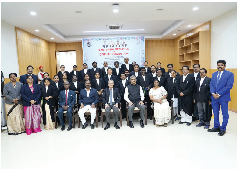
Glimpse from a Training Programme Organized by Andhra Pradesh SLSA

February 17, 2025: A 40-hour Mediation Training Programme was conducted at the premises of the Hon'ble High Court, organized by the Andhra Pradesh SLSA, Andhra Pradesh HCLSC, and the Mediation and Conciliation Project Committee (MCPC). The programme was inaugurated by Hon'ble Mr. Justice Ravi Nath Tilhari, who emphasized the importance of mediation in resolving disputes efficiently and reducing court caseloads. The Master Trainer provided participants with hands-on training in mediation techniques. The training aimed to enhance participants' mediation skills, enabling them to resolve disputes amicably and contribute to a more efficient justice system. The programme received an enthusiastic response from participants, reflecting a growing recognition of mediation as a vital tool in access to justice. Such initiatives are instrumental in building a cadre of trained mediators to support alternative dispute resolution mechanisms across the country.