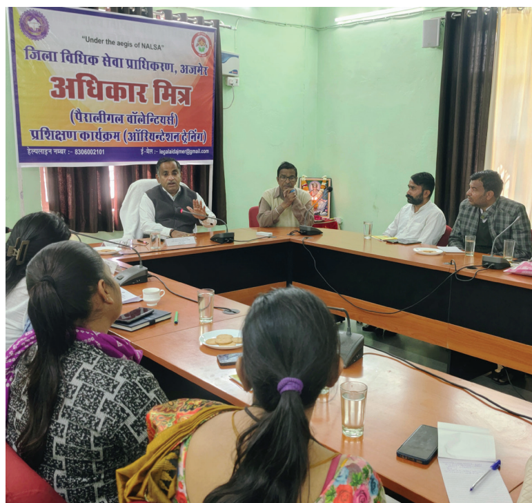
Glimpse from Orientation Training Organized by DLSA, Ajmer (Rajasthan)

March 6, 2025: DLSA, Ajmer (Rajasthan), organized a Training-cum-Sensitization Session titled “PLV Orientation Training.” The session aimed to enhance the knowledge and capacity of Para Legal Volunteers (PLVs) by providing in-depth insights into the Para Legal Volunteer Scheme, its objectives, and implementation framework. The training focused on equipping participants with the necessary legal awareness and practical skills to effectively serve their communities and assist in promoting access to justice. It emphasized the vital role PLVs play in supporting marginalized groups and facilitating legal aid. Through interactive discussions and case studies, the session aimed to prepare PLVs to address common legal issues and provide assistance in legal matters such as domestic violence, women’s rights, and access to government schemes. This initiative contributed to building a stronger, more knowledgeable network of volunteers dedicated to enhancing legal awareness and access to justice within the community. Participants also shared field experiences, allowing for collective learning and exchange of strategies to address grassroots legal challenges. The session reinforced the importance of empathy, vigilance, and accountability in PLVs’ day-to-day roles.