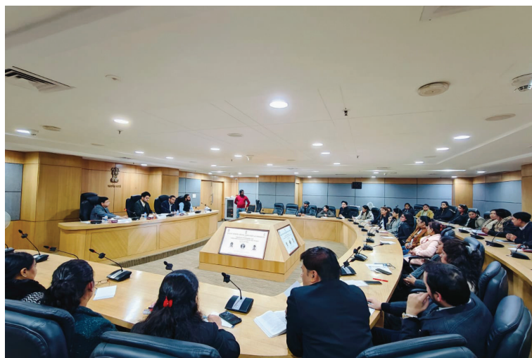
Glimpse from a Training Programme Organized by Delhi SLSA