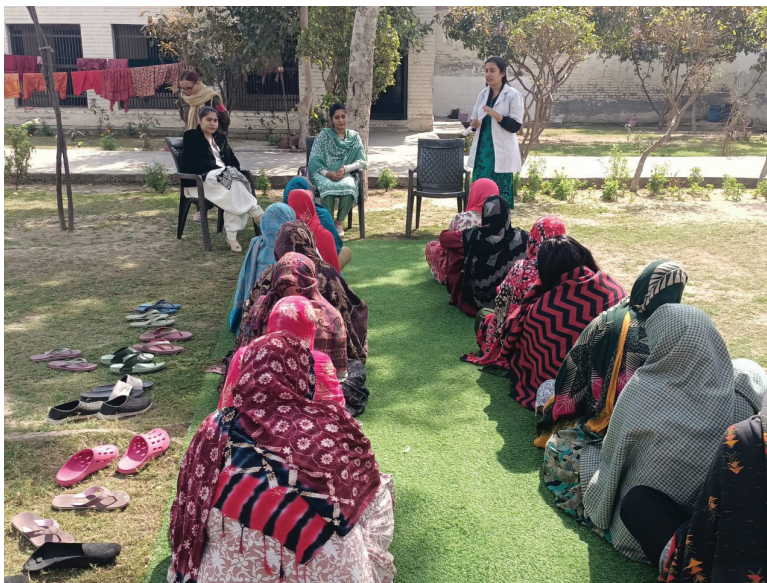
DLSA, Kaithal (Haryana) at District Jail, Kaithal

January 17, 2025: DLSA, Kaithal (Haryana), in collaboration with the Legal Aid Defence Counsel Office, organized five awareness programmes for female inmates of District Jail, Kaithal. The inmates were informed about their rights, including access to free legal aid, bail, parole, furlough, education, and the procedure for applying for legal assistance under the Legal Services Authorities Act, 1987. The sessions were specifically designed to empower the female inmates by providing them with crucial legal knowledge and practical insights, enabling them to better understand and navigate the complexities of the justice system. A total of 24 female inmates benefited from these sessions, gaining a clearer understanding of their rights and available resources. The initiative aimed to create an environment of legal literacy, ensuring that the inmates were aware of the legal support they could access for their rehabilitation, overall well-being and to assert their rights and seek justice.