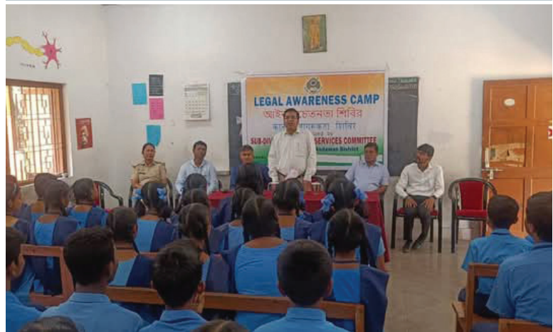
DLSA, Andaman & Nicobar Islands at VKV Zilla Parishad School, Basantipur

February 24, 2025: DLSA, Dibang Valley (Arunachal Pradesh), organized a one-day Free Legal Awareness Camp at the Government Residential School in Punli. The session aimed to enlighten students and staff about key legal safeguards for children, focusing on the Protection of Children from Sexual Offences (POCSO) Act, 2012, and the Prohibition of Child Marriage Act, 2006. The camp sought to enhance awareness and understanding of child protection laws, promoting legal literacy among young learners and empowering them with knowledge about their rights and protections under the law. It also encouraged open discussions about challenges faced by children in the community and highlighted the importance of reporting any form of abuse. The session was designed to ensure that the students and staff are equipped with the essential information and practical knowledge to protect themselves and those around them.