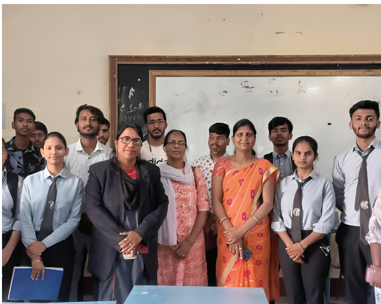
Glimpse from a Legal Awareness Programme conducted by DLSA, Jaipur (Rajasthan)

March 11, 2025: DLSA, Jaipur (Rajasthan), in collaboration with SSG Pareek College, Jaipur, organized an awareness campaign titled "Sensitization Programme on the Rights of Women, Scheduled Castes, Children, the Elderly, Persons with Disabilities, Poor Migrants, People Living with HIV/AIDS, and Transgender Persons." The primary objective of the campaign was to spread awareness about the rights and legal provisions available to these vulnerable groups and to promote inclusivity and legal empowerment through education. The session highlighted the importance of legal safeguards and support systems for marginalized communities. The event saw enthusiastic participation from 35 students, who actively engaged in meaningful discussions and gained valuable insights into the legal protections and resources available to these groups. The campaign aimed to cultivate a sense of social responsibility and encourage the students to become advocates for the rights and welfare of these vulnerable populations.