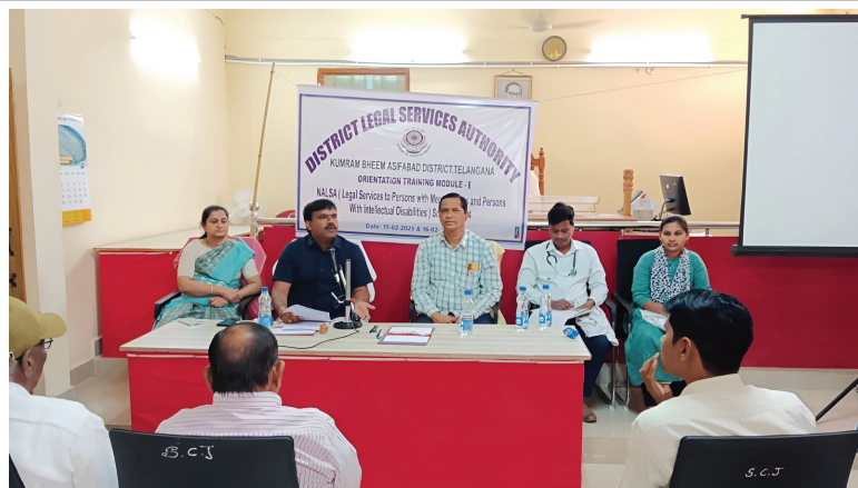
Glimpse from Capacity Building Programme Organized by DLSA, KB Asifabad (Telangana)

February 15 & 16, 2025: DLSA, KB Asifabad (Telangana), conducted an Orientation Training Programme for members of the Legal Services Unit for Persons with Mental Illness and Persons with Intellectual Disabilities under the NALSA (LSUM) Scheme, 2024. The training was held at the Senior Civil Judge Court Hall in Asifabad. The session was designed to provide the members with comprehensive knowledge and practical skills to effectively assist individuals with mental illnesses and intellectual disabilities in navigating and accessing legal services. The programme also focused on engaging participants in understanding the legal challenges faced by these individuals and provided insights into their rights and the legal provisions available for their protection and empowerment.