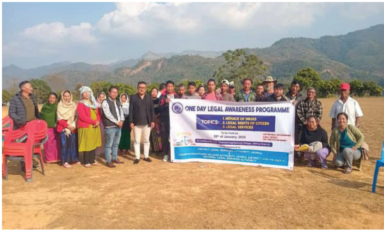
DLSA, Ukhrul (Manipur) at Champhung/Aphung Village

February 20, 2025: DLSA, Kra-Daadi (Arunachal Pradesh) District organized a legal awareness programme titled “ Legal Awareness Campaign ” at Nyokum Ground, Palin. The programme aimed to educate the public on various legal rights and welfare schemes, including key NALSA and State Schemes such as the Sexual Harassment of Women at Workplace (Prevention, Prohibition and Redressal) Act, 2013 (POSH Act), the Victim Compensation Scheme, 2024, the Protection of Children from Sexual Offences (POCSO) Act. A total of 48 individuals participated in the campaign, which served as an important initiative to spread legal awareness and ensure that citizens are informed of their rights and the legal remedies available to them. This initiative fostered a sense of confidence amongst the participants.