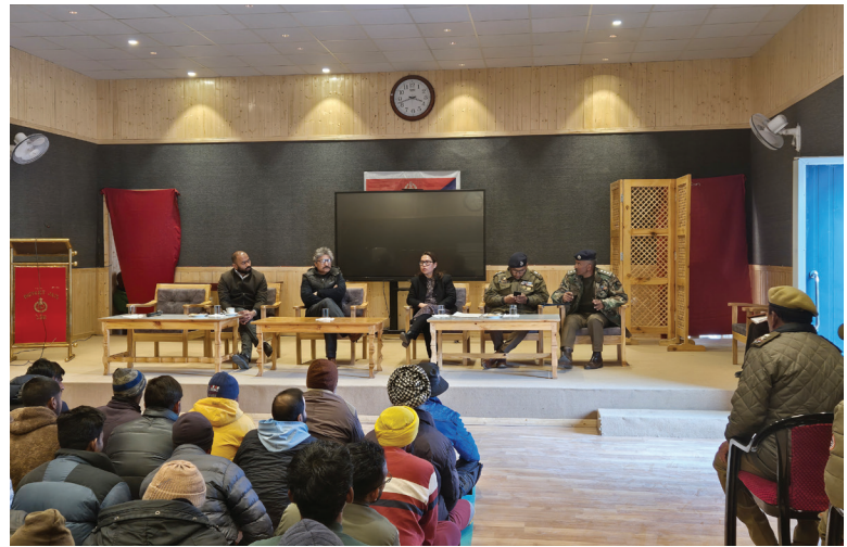
DLSA, Leh (Ladakh) at District Jail, Leh

March 27, 2025: DLSA, Leh (Ladakh) organized an awareness programme at the District Jail, Leh, focusing on the rights and entitlements of prisoners. As part of the initiative, the DLSA also conducted a screening to identify undertrial prisoners who were unrepresented, in order to extend free legal aid and ensure access to justice. This outreach programme aimed to create awareness among inmates about their legal rights while reinforcing the commitment of the DLSA to safeguard the rights of undertrial prisoners. Additionally, the programme highlighted the importance of legal representation in ensuring fair trial and preventing prolonged detention without proper legal recourse. The initiative emphasized the DLSA's role in promoting legal literacy and fostering a more inclusive justice.