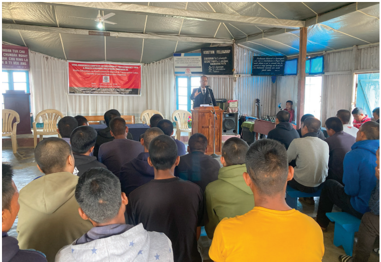
Glimpse from a Legal Awareness Programme at District Jail, Lunglei (Mizoram)

January 6, 2025: A legal awareness camp was organized by DLSA Nainital (Uttarakhand) at District Jail Nainital and Sub Jail Haldwani, where prisoners' concerns were addressed by the Hon'ble Chairman, DLSA. Inmates were informed about National Lok Adalat, compounding, remission, commutation, the e-Prison portal, e-true copy, and sensitization was done regarding various schemes and prisoner rights. It emphasized the importance of legal support and dignity for incarcerated individuals. The benefits of skill development were highlighted, with discussions focusing on how acquiring new skills can significantly contribute to the rehabilitation and reintegration of prisoners into society post-release. Jail PLVs were sensitized on the NALSA Prison Legal Aid Clinic SOP to ensure effective implementation of legal aid services inside prisons. A survey on caste-based discrimination in jail work allotment was also conducted.