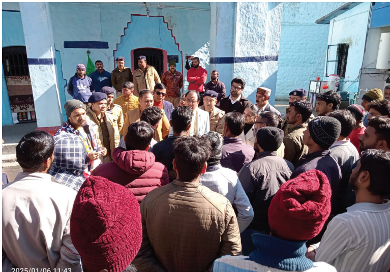
DLSA Nainital (Uttarakhand) at District Jail Nainital and Sub Jail Haldwani

February 13, 2025: A Special Campaign and Legal Awareness Programme was conducted at District Jail, Lunglei (Mizoram) in collaboration with the Healthy Lunglei Campaign. The initiative included a health screening drive to address the legal and medical needs of the inmates, ensuring their holistic well-being and access to justice. In addition to providing legal awareness on topics such as prisoner rights, legal aid, and available support schemes, the programme aimed to promote health and wellness among the inmates. The session offered a holistic approach to care, addressing both an individual's physical health concerns and legal entitlements, ensuring they are informed and empowered in seeking justice and support. This multifaceted and rehabilitative campaign underscored the critical and often overlooked link between legal empowerment and physical well-being within custodial settings.