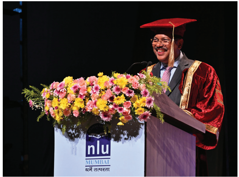
Glimpse from MNLU Convocation: MoU signed for a one-month internship programme with MNLU

With the approval of Hon'ble Mr. Justice B.R. Gavai, Judge, Supreme Court of India and Executive Chairman, NALSA, a significant boost was given to clinical legal education through the approval of proposals submitted by select universities. At MNLU Nagpur, an exclusive one-month internship at Legal Services Institutions was approved as a mandatory component of the B.A. LL.B. (Hons. in Adjudication and Justicing) five-year degree programme. At MNLU Mumbai, a four-week Internship Programme on Legal Research, Drafting, and Practical Exposure to Governance Mechanisms was approved for first and second-year law students, aimed at fostering a deeper understanding of the functioning of legal services authorities and judicial institutions. NLU Delhi has also been granted approval to involve students in various projects under NALSA and legal aid framework, offering them valuable experiential learning opportunities.