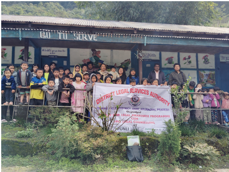
DLSA, Dibang Valley (Arunachal Pradesh) at Government Residential School, Punli

At Colleges & Schools : Empowering the Future Leaders through Knowledge