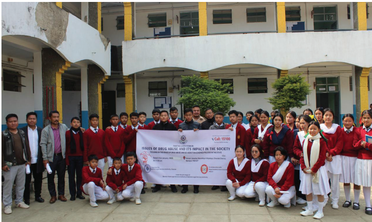
DLSA, Chandel (Manipur) at Jawahar Navodaya Vidyalaya (JNV)

January 30, 2025: DLSA, Dehradun (Uttarakhand), organized a legal awareness camp at Shri Guru Ram Rai Public School, Bindal, to educate students on important legal and social issues. The session covered the POCSO Act, Cybercrime, Social Media fraud, the ill effects of drug addiction, and introduced students to the NALSA toll-free legal aid helpline 15100. In addition to the awareness programme, a cleanliness rally was conducted by the students to mark National Cleanliness Day, promoting hygiene and social responsibility. The event witnessed enthusiastic participation and served as a meaningful initiative towards empowering youth through legal knowledge and civic awareness. Resource persons from the legal fraternity and police department engaged with the students, addressing their queries and encouraging proactive legal awareness. The session adopted a student-friendly approach, making complex legal topics more relatable for the young audience.