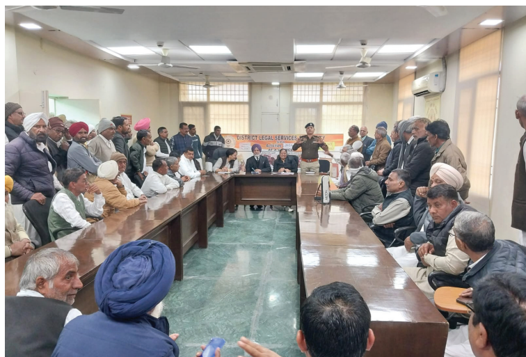
Glimpse from a Capacity Building Programme Organized by DLSA, Sirsa (Haryana)

January 17, 2025: DLSA, Sirsa (Haryana), conducted a meeting with Para-Legal Volunteers (PLVs) to review their work and discuss various NALSA Schemes. During the meeting, PLVs shared the challenges they face while organizing legal aid camps in remote areas in reaching marginalized communities. Panel Advocates, briefed the PLVs on two important NALSA Schemes: the NALSA (Effective Implementation of Poverty Alleviation Schemes) Scheme, 2015, which helps people access government poverty alleviation programmes, and the NALSA (Legal Services to Workers in the Unorganized Sector) Scheme, 2015, which focuses on providing legal support to workers in the unorganized sector. The session aimed to equip PLVs with the knowledge and tools to effectively implement these schemes in their respective areas. The meeting concluded with a renewed commitment to strengthen grassroots legal outreach.