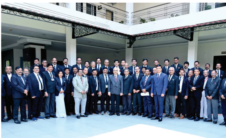
Glimpse from Refresher Training Programme conducted at Chhattisgarh State Judicial Academy

March 23, 2025: A One-Day Refresher Training Programme was organized for Legal Aid Defense Counsels at the Chhattisgarh State Judicial Academy. The training aimed to strengthen the legal knowledge, courtroom skills, and procedural understanding of Legal Aid Defense Counsels to ensure effective representation of beneficiaries with professionalism, empathy & a strong commitment to justice under the legal aid system. The programme included expert-led sessions, interactive discussions, and practical insights on recent developments in criminal law and defense strategies. Participants also had the opportunity to engage in case studies to apply the knowledge gained in real-world scenarios. This initiative forms an integral part of the ongoing and concerted efforts to enhance the quality and efficiency of legal aid services across the state.