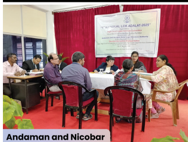
Andaman and Nicobar