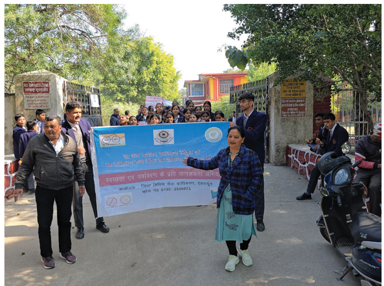
DLSA, Dehradun (Uttarakhand) at Shri Guru Ram Rai Public School, Bindal

January 30, 2025: DLSA, Dehradun (Uttarakhand), organized a legal awareness camp at Shri Guru Ram Rai Public School, Bindal, to educate students on important legal and social issues. The session covered the POCSO Act, Cybercrime, Social Media fraud, the ill effects of drug addiction, and introduced students to the NALSA toll-free legal aid helpline 15100. In addition to the awareness programme, a cleanliness rally was conducted by the students to mark National Cleanliness Day, promoting hygiene and social responsibility. The event witnessed enthusiastic participation and served as a meaningful initiative towards empowering youth through legal knowledge and civic awareness. Resource persons from the legal fraternity and police department engaged with the students, addressing their queries and encouraging proactive legal awareness. The session adopted a student-friendly approach, making complex legal topics more relatable for the young audience.