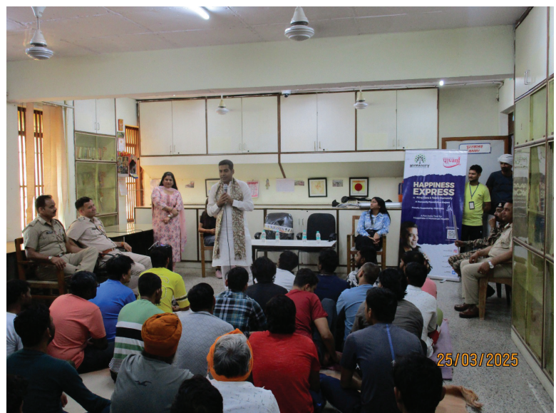
DLSA, North (New Delhi) at Central Jail No. 10, Rohini

March 25, 2025: DLSA, North (New Delhi) organized a mental health awareness session titled "From Isolation to Connection" at Central Jail No. 10, Rohini, for inmates, Para Legal Volunteers (PLVs), legal sewadars, and staff. The session emphasized the importance of mental well-being, offering coping strategies for stress, isolation, and anxiety, along with mindfulness techniques and information on available psychological support within the correctional system. Around 40 inmates actively participated, sharing their experiences in an open and supportive environment. The session aimed to destigmatize mental health issues and promote emotional resilience, ensuring inmates were aware of the mental health resources available to them. The session concluded with one-on-one counseling and guidance for the inmates on accessing ongoing mental health resources, empowering participants to take proactive steps toward improving their mental well-being.