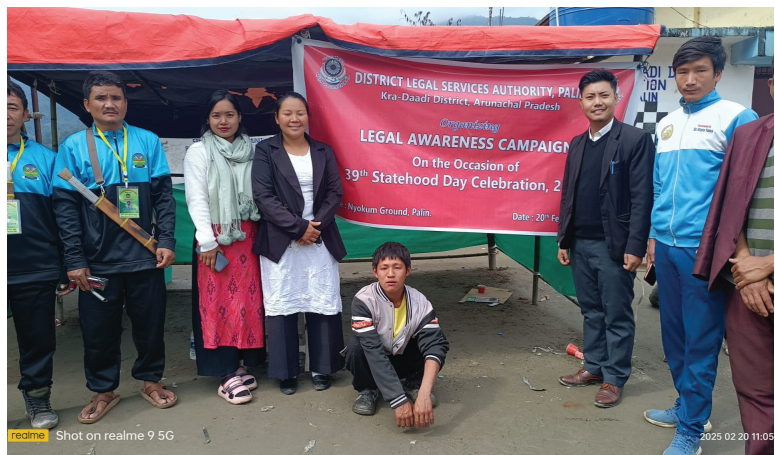
DLSA, Kra-Daadi (Arunachal Pradesh) at Nyokum Ground, Palin

January 28, 2025: DLSA, Ukhrul (Manipur), in collaboration with Tora Legal Aid Clinic, organized a Legal Awareness Programme at Champhung/Aphung village in Ukhrul District. The programme focused on three key topics: the menace of drug abuse, legal rights, and the availability of legal services. Advocates from Ukhrul District served as the Resource Person, delivering insightful guidance on these important issues. A total of 50 participants attended the session, which aimed to empower the local community with knowledge of their rights and available legal remedies while also addressing the growing concern of drug abuse. Resource persons engaged in interactive discussions with community members, encouraged them to speak openly about challenges faced within their locality.