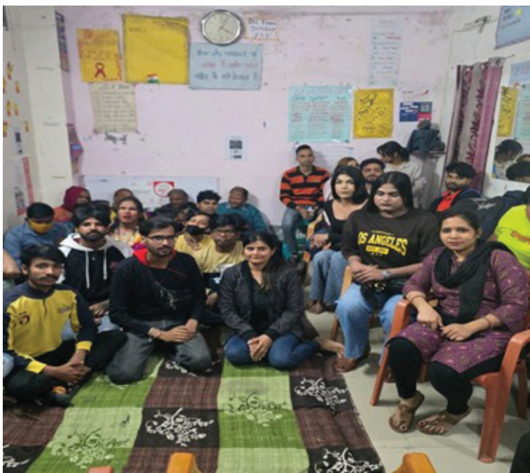
Glimpse from a Legal Awareness Programme conducted by DLSA, South-East (New Delhi)

March 5, 2025: DLSA, South-East (New Delhi), in collaboration with Bal Vikas Dhara NGO, organized an awareness session for transgender individuals and sex workers on the topic “ Legal Rights of Sex Workers & Fundamental Rights. ” The session witnessed the participation of approximately 40 individuals. The initiative aimed to raise awareness about the legal provisions and protections available to sex workers and transgender persons, including their fundamental rights and access to justice. The Participants were also informed about available support systems such as the NALSA Helpline (15100) and DSLSA Helpline (1516), both of which are operational 24x7. The session not only fostered open dialogue but also addressed individual concerns, and emphasized the importance of dignity, equality, and legal empowerment for marginalized communities. Through an interactive format, the initiative created a safe and inclusive space for participants to share their experiences and better understand their legal rights. It also reinforced the commitment of legal services institutions to extend meaningful support to those who are often on the fringes of the justice system.